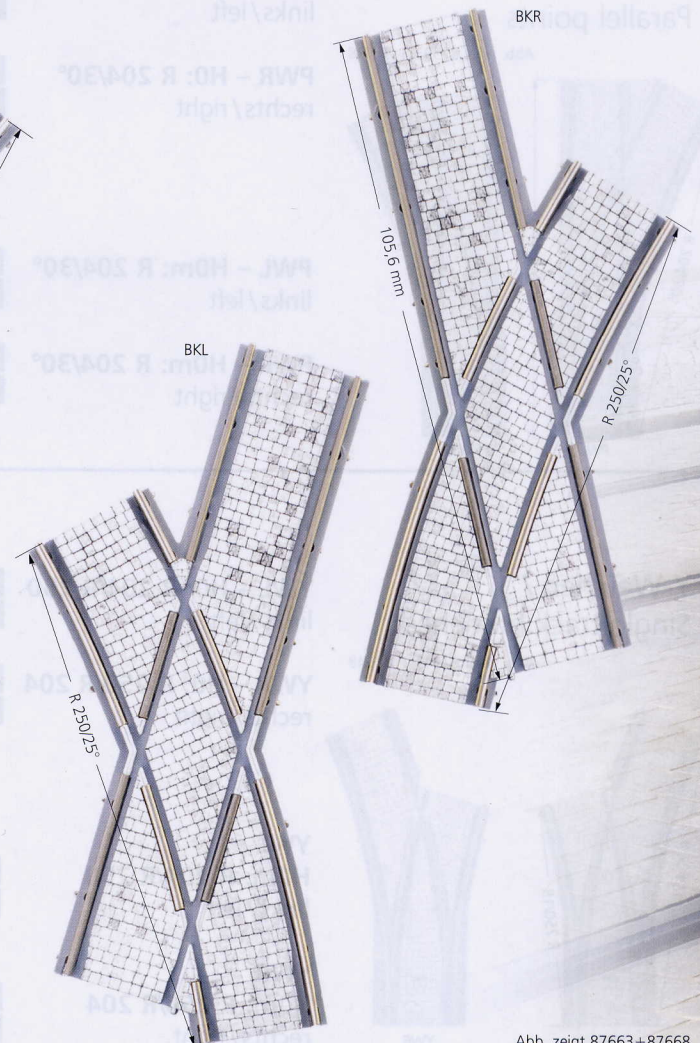
Abb. zeigt 87663+87668